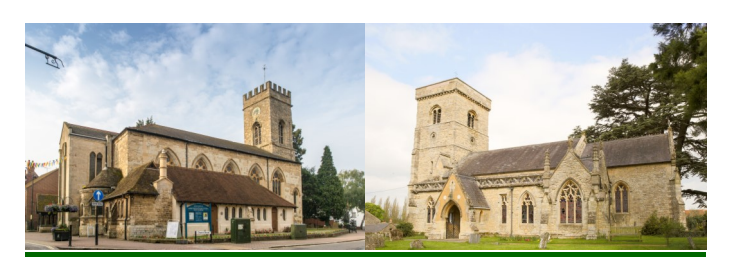
St Mary & St Giles with All Saints, Parish of Stony Stratford with Calverton THE SEVENTEENTH SUNDAY IN ORDINARY TIME 26th July AD 2020